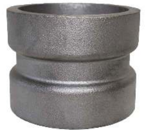
70/30 CUNI (ALLOY C715/C964)