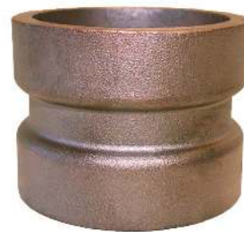
90/10 CUNI (ALLOY C706/C962)